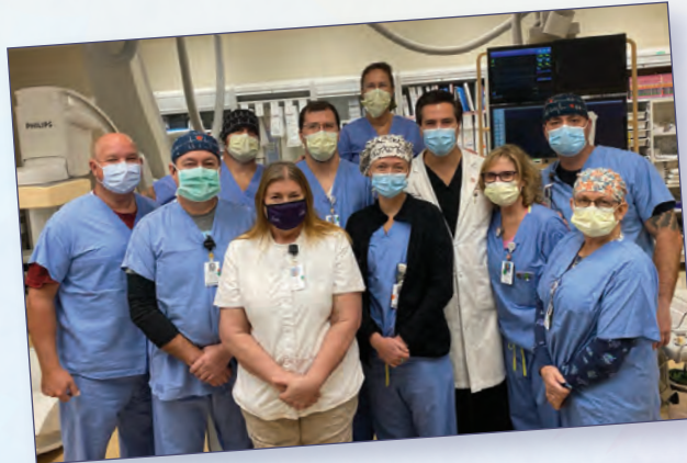
The Parrish Medical Center cardiac cath lab team.

AV block is a type of heart block in which the electrical signals between the chambers of the heart (the atria and the ventricles) are impaired. Pacemakers, the most common way to treat AV block, help restore the heart's normal rhythm and relieve symptoms by coordinating the electrical activity of the atria and the ventricles. When this process—known as AV synchrony—is achieved, patients are healthier and have decreased likelihood of pacemaker syndrome, improved quality of life, and increased blood flow from the left ventricle.